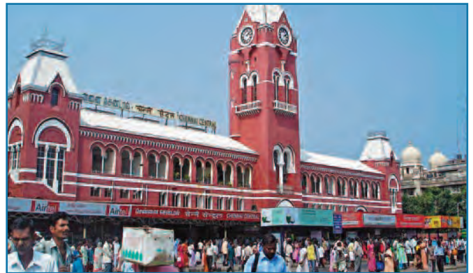
Chennai Central Railroad Station