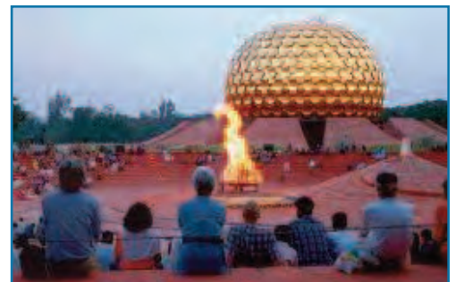
Matrimandir, Auroville, Pondicherry

Pondicherry is a union territory that still displays its French influence in certain parts. "The Ashram," founded by the well-known philosopher Sri Aurobindo in 1920, attracts thousands of visitors a year from all over the globe. Auroville , the inspiration of the mother (a French woman who was a spiritual collaborator of Aurobindo's), was established in 1960. This International City of Dawn has a number of communities living in harmony. The Matri Mandir is another place of interest in this town.