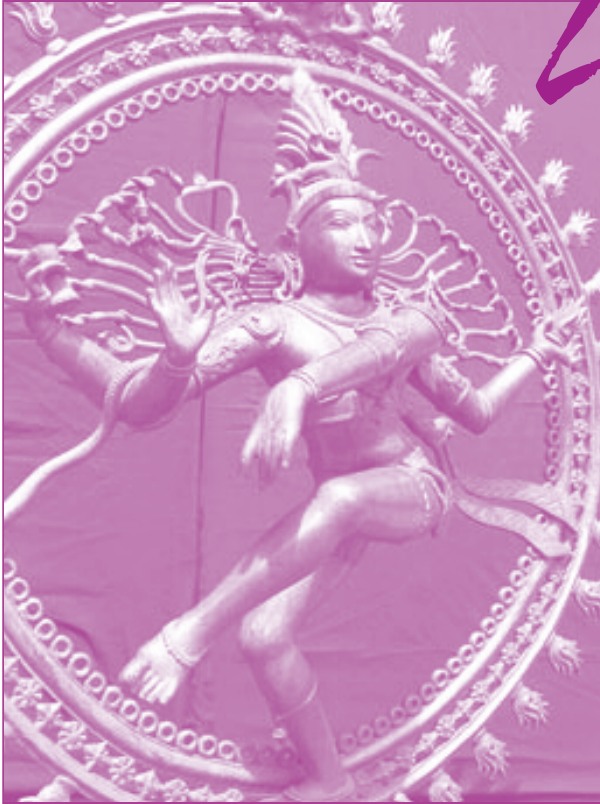
Lord Shiva in his manifestation as Nataraja, the lord of the cosmic dance.