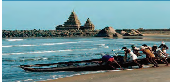
Shore Temples of the Pallavas

SHOPPING: Textiles, jewelry, handicrafts, books—whatever you desire can be picked up from a wide variety of places to suit all budgets. Explore the shops run by various states of India, the stores dedicated to specific items, the malls that provide all under one roof, the roadside shops, or even the street vendors. Come, fill your bags with gifts for yourself and others!