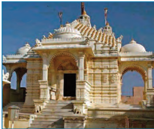
Jain Temple, Chennai

India and is known for Marina beach, the second longest beach in the world. The Chennai metropolitan area consists of three districts: Chennai city, Kanchipuram, and Thiruvallur. A fast-developing city, it has all the modern comforts for accommodation, transport, and employment and yet retains old-world grandeur and allegiance to traditions in food, dress, décor, and celebration of festivals. Thus, amidst the humdrum bustle of work, one can still experience the charm, culture, and courtesies of days gone by. The grandeur of Chennai's past is preserved in its many museums and places of worship, including temples, churches, and mosques. It is also showcased at Dakshina chitra, a center for the