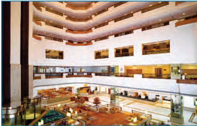
Lobby of the Hotel GRT Grand

Flyglobal Tours and Events Pvt. Ltd help desk to provide options